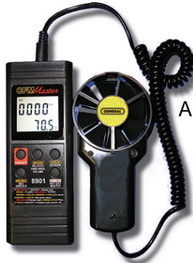
Infrared thermographic camera Anemometer m/s (avg/max/actual)+Temp