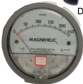
Differential atmospheric pressure gauge