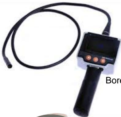
Borescope camera with 3m extension