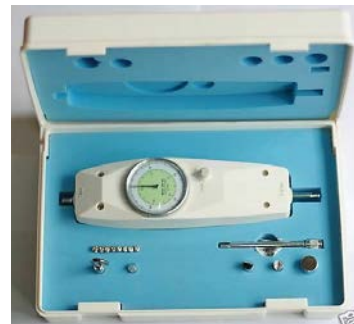
Newton (Door open force)