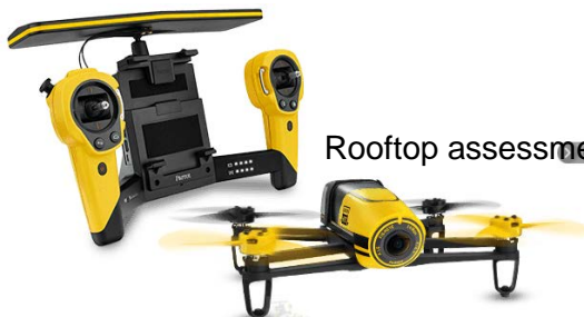
Rooftop assessment by drone