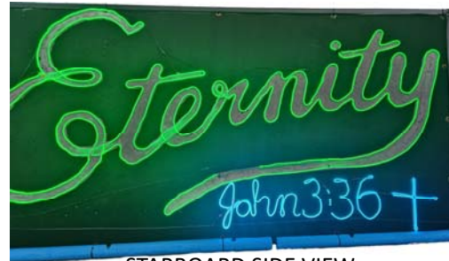
STARBOARD SIDE VIEW

https://www.lakemac.com.au/Events-directory/Council-events/Float-Your-Boat