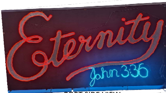
PORT SIDE VIEW

John 14:6 Jesus said: "I am the Way, the Truth, and the Life. No-one comes to the Father (God) except through me!" So I implore you to become fully committed followers of Jesus Christ.